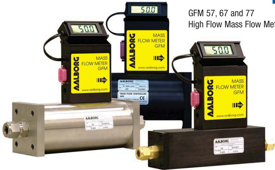
GFM 57, 67 and 77 High Flow Mass Flow Meters