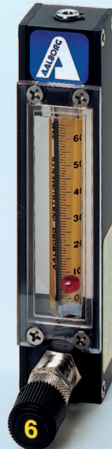
65 mm Meter with MFV™ Valve