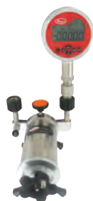
DCGII with Pump

Compatible with calibration pumps in Test Equipment section