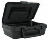
Protective Carrying Case