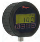
DPG-100 with Protective Rubber Boot