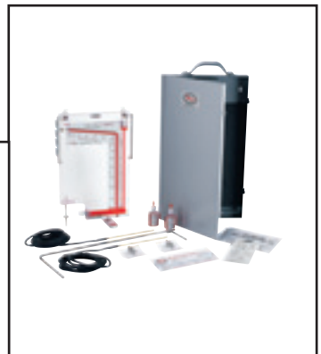
Complete Kit, Model 400-10

Left — Model No. 400-5 Air Meter, 0-5" W.C., 400-9000 f.p.m.